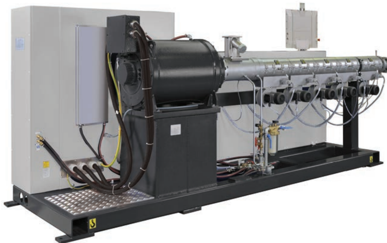
soLEX GL extruder from the rear

Outputs may vary depending on materials used, upstream and downstream equipment. All outputs specified above are warranty outputs. The output figures quoted are based on the battenfeld-cincinnati materials reference list.