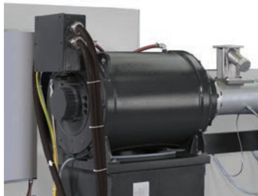
High-torque motor of the soLEX GL extruder