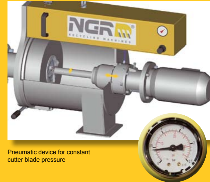
Pneumatic device for constant cutter blade pressure