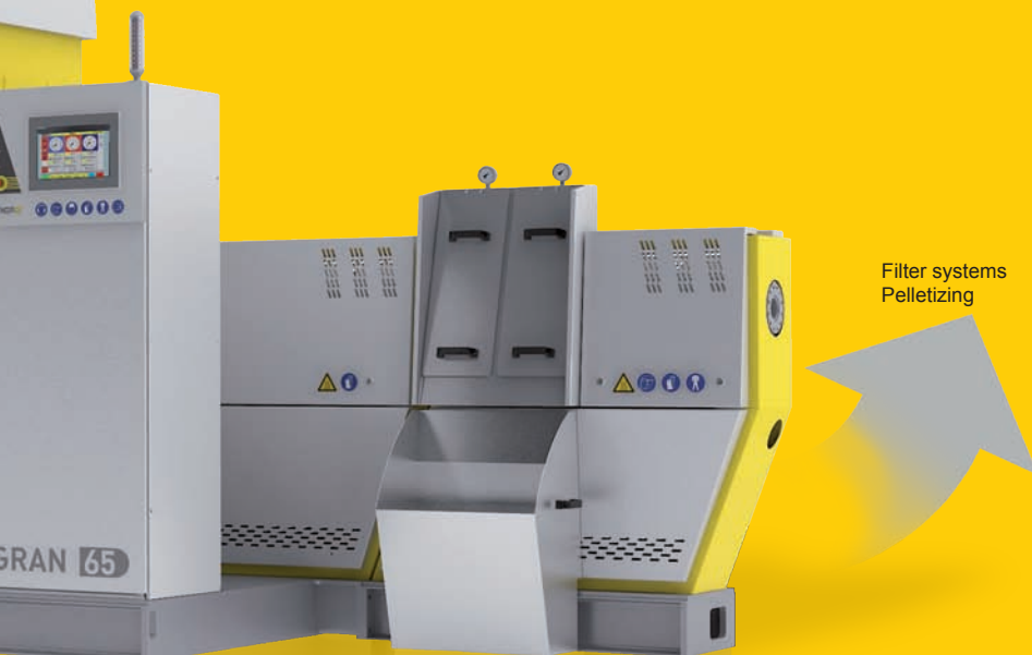
Filter systems Pelletizing