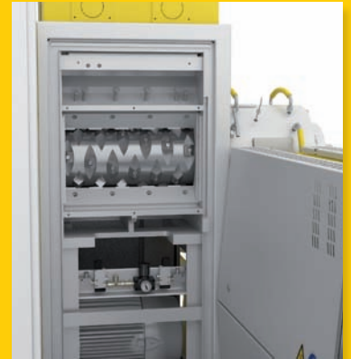
Cutter maintenance opening

In addition, NGR also supplies the entire pellets transport equipment such as blowers, piping, cyclones, etc.