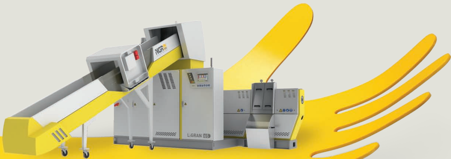
L:GRAN 65 V

...pellets output up to 230 kg/h (500 lbs/hr)