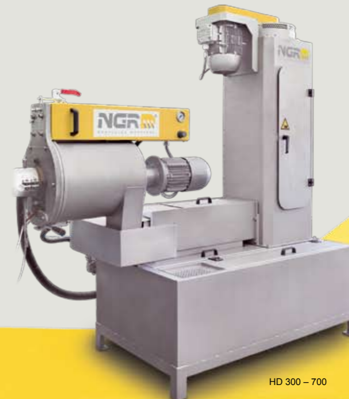
HD 300 – 700