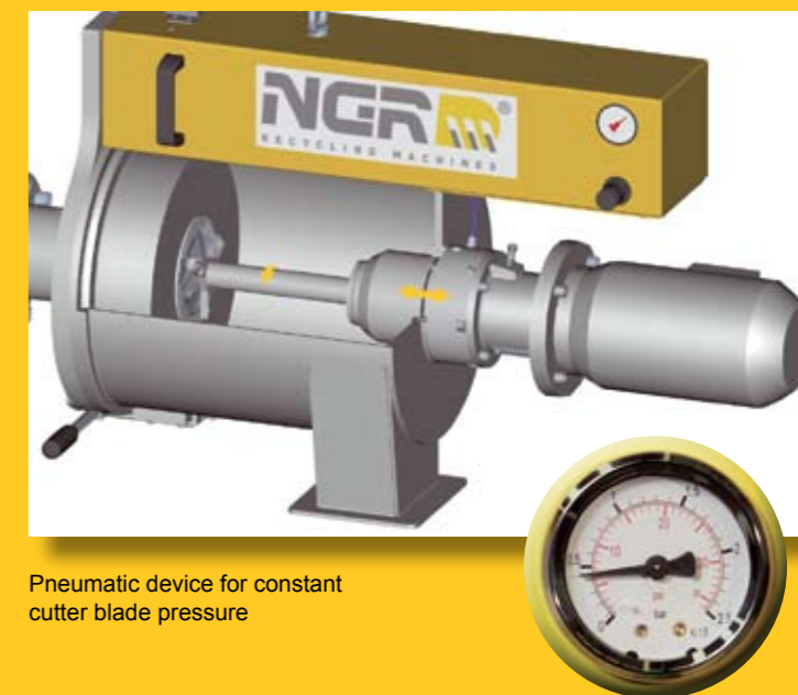
Pneumatic device for constant cutter blade pressure